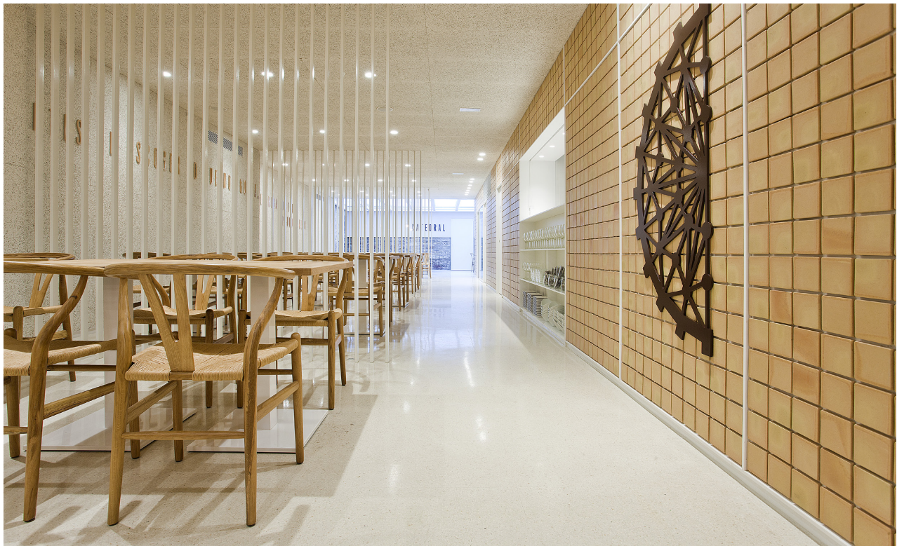
Figure 1. Installed product

The results of the Life Cycle Analysis (LCA) of this EPD are based on data provided by manufacturers of 40% of the Spanish ceramic tile production. The participants have provided all the data and, therefore, it is considered that the results obtained in this study are representative of the Spanish ceramic tile manufacturing sector. The scope of this EPD is from cradle to grave.