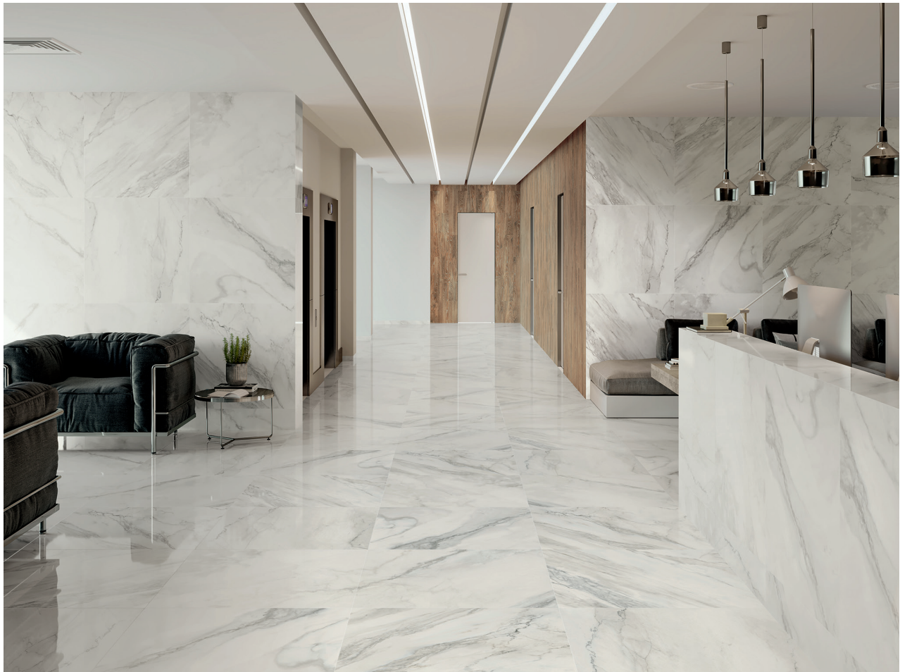
Figure 4. Installed product

Ceramic coverings release no compounds into the soil or water during their use stage because a completely inert product is involved that undergoes no physical, chemical, or biological transformations, is neither soluble nor combustible, and does not react physically or chemically or in any other way, is not biodegradable, and does not adversely affect other materials with which it enters into contact such that it might produce environmental pollution or harm human health. It is a non-leaching product, so that it does not endanger the quality of surface water or groundwater.