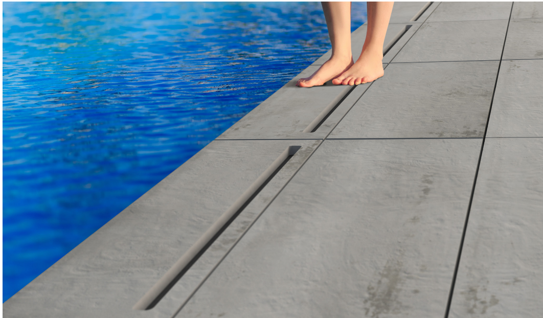
Figure 2. Installed product