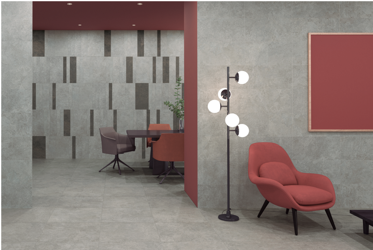
Figure 2. The tiles when laid.

The following table shows the technical properties of all the ceramic tiles in accordance with the requirements of the UNE-EN 14411:2016 standard.