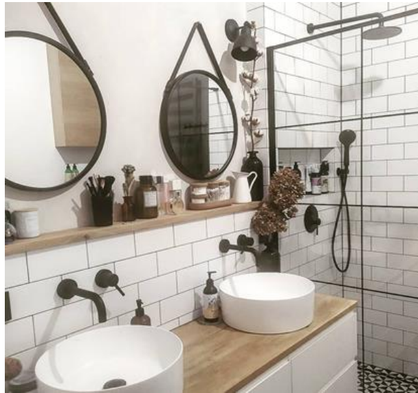
Figure 4 Installed product.