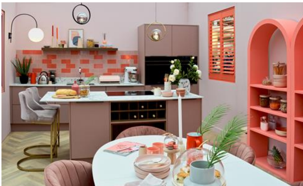
Figure 5 Installed product.

The environmental burdens and benefits of obtaining secondary material from waste generated at the manufacturing stage (waste such as cardboard, plastic and wood), at the installation stage (product losses, tile packaging waste: cardboard, plastic and wood) and at the end of life of the product have been considered.