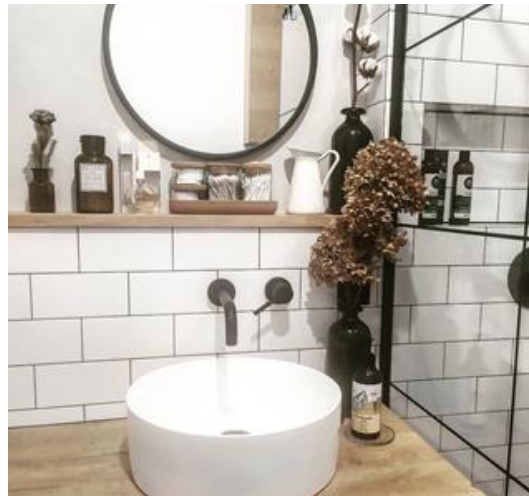
Figure 2 Installed product.

The Life Cycle Assessment (from now on LCA) has been carried out using GaBi 10.0.0.71 [5] software and the data base version 2020.1. (SP40.0) [6] (SpheraSolutions). The characterization factors used are those included in EN 15804:2012+A1:2013 standard.