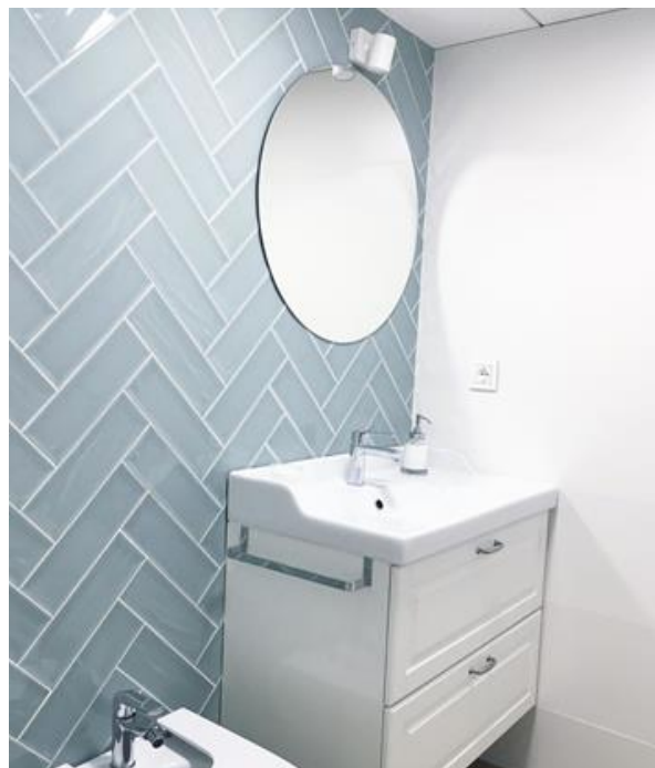
Figure 1 Installed product.

The product features are included in the technical datasheets which can be requested from the manufacturer, being them, the ones required by the EN 14411:2016 standard.